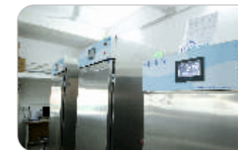
Stability Study Facilities