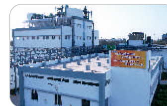
Unit 3 (Plant 1)

The new facility is located in the Ankleshwar GIDC area of Gujarat, India, and is equipped with the latest technology and equipment to produce high-quality APIs and drug intermediates. The facility also has a well-equipped quality control laboratory, where all APIs and drug intermediates are thoroughly tested before being released to customers.