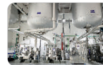
API Production Facilities (GMP)