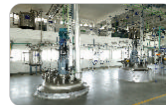
Intermediates Production Facilities (GMP)