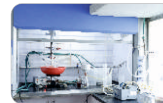
Research and Development